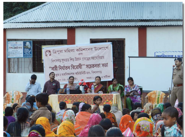
Awareness programme on prevention of crime against women in Arovidanagar Village at Bishalghar on 20th Nov 2013.