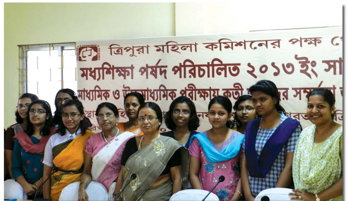
Falicitation prog to the achiever girls in Board Exam 2013 on 6th June 2013 at Conference Hall, TCW.JPG