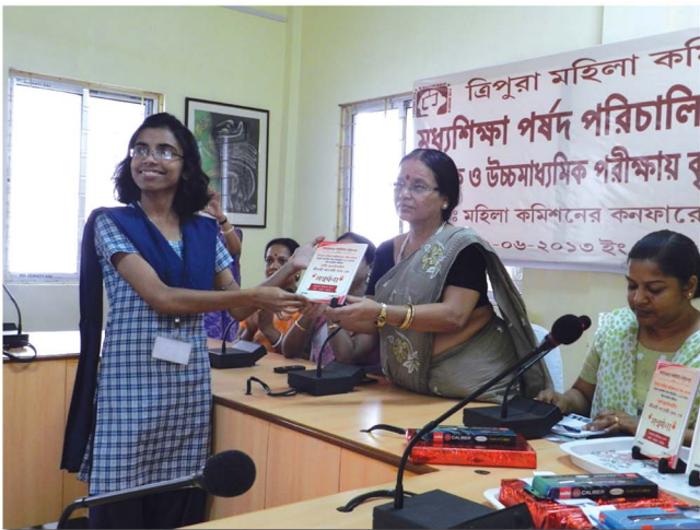
Felicitation prog to the achiever girls of Board Exam 2014 on 12th June 2013 in the Conference Hall of TCW.