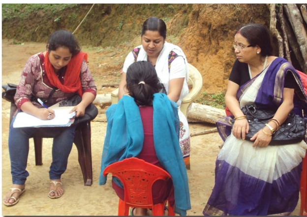
11 Investigation programme of a rape incident on 24th May 2013 at Manaipathar ADC Village.