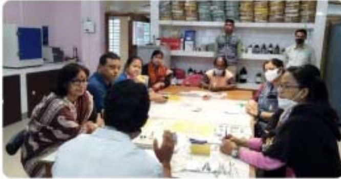
Chairperson, TCW, have paid her visit to Forensic Laboratory along with other Members, Member secretary, Law Officer and other Officials