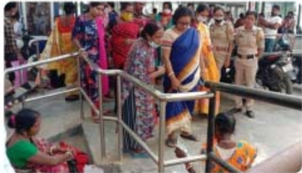
Rescued vagabond lady by the chairperson, TCW alongwith police and other representatives.