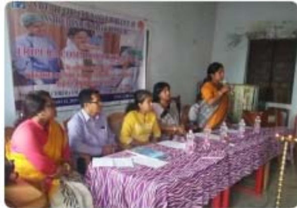
Awareness Programme on Save the Girl Child and importance of institu- tional hospital delivery.