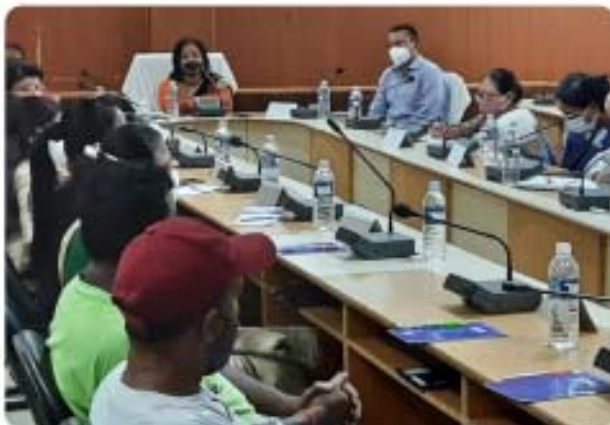
Commission arrange meeting with DM and Collector, west, TCPCR, NGO and with other high officials for protecting society as well as different localities from various evil activities. Meeting was presided over by the Chairperson, TCW.