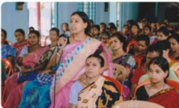
Question raised by the participants in Legal Awareness Programme regarding various social and legal issues