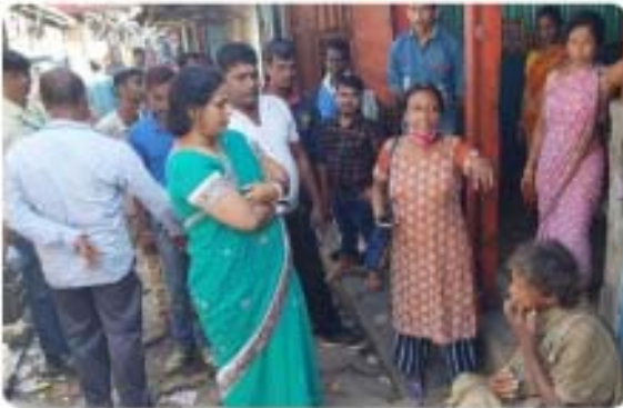
Rescued mentally ill lady with the help of local people by Chairperson, TCW and other officials.