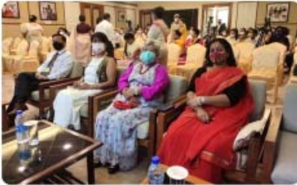
Seminar attended by Chairperson, TCW, outside Tripura.