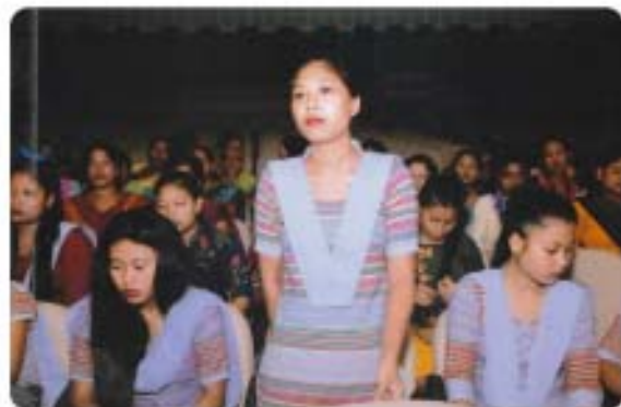
Question raised by the participants in Legal Awareness Programme regarding various social and legal issues.