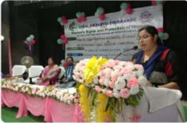
Legal Awareness Programme attended by Law Officer.

Commission arrange meeting with DM and Collector, west, TCPCR, NGO and with other high officials for protecting society as well as different localities from various evil activities. Meeting was presided over by the Chairperson, TCW.