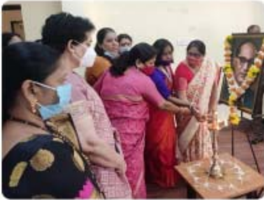
Seminar attended by the Chairperson, NCW and Chairperson of other States outside Tripura.