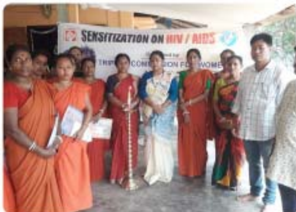
Sensitization Programme on HIV / AIDS organised by Tripura Commis- sion for Women, Agartala, in associa- tion with AIDS Control Society, Agartala.