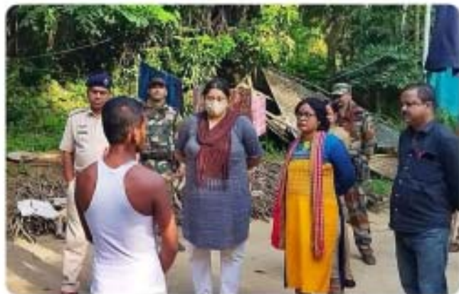
Investigation done by the chairperson, TCW, alongwith Law officer and Senior Counsellor.