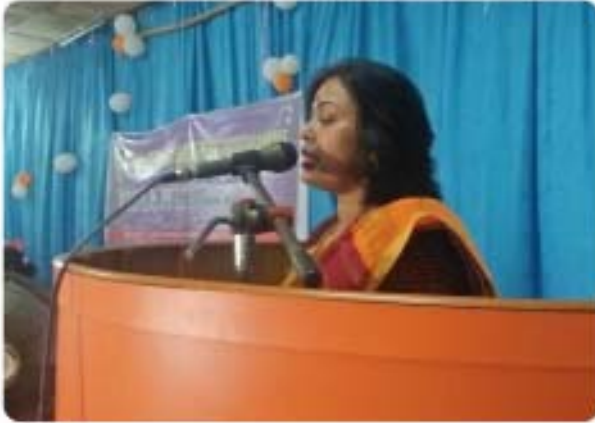
Valuable speech given by Ch airperson, TCW on a Seminar.