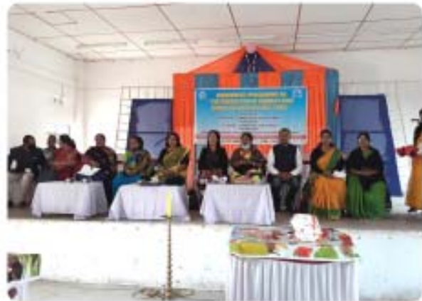
Awareness Programme, organised by TCW in association with NCW.